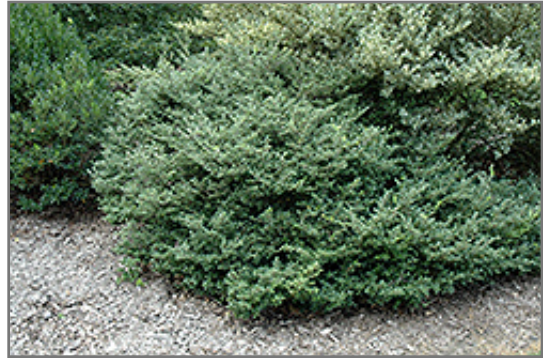
Stokes Japanese Holly