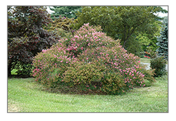
Caddo Crapemyrtle in bloom

This shrub will require occasional maintenance and upkeep. Trim off the flower heads after they fade and die to encourage more blooms late into the season. It has no significant negative characteristics.