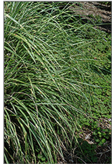
Little Zebra Dwarf Maiden Grass foliage