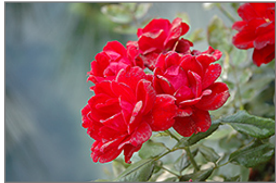
Kolorscape Milano Rose flowers

Kolorscape Milano Rose will grow to be about 4 feet tall at maturity, with a spread of 24 inches. It tends to fill out right to the ground and therefore doesn't necessarily require facer plants in front. It grows at a fast rate, and under ideal conditions can be expected to live for approximately 30 years.