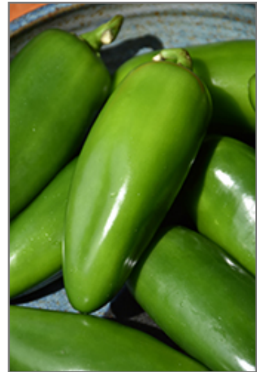
Jalapeno Pepper fruit

Jalapeno Pepper will grow to be about 3 feet tall at maturity, with a spread of 24 inches. This vegetable plant is an annual, which means that it will grow for one season in your garden and then die after producing a crop.