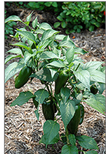
Jalapeno Pepper fruit