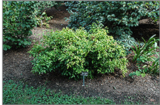
Wood's Dwarf Nandina