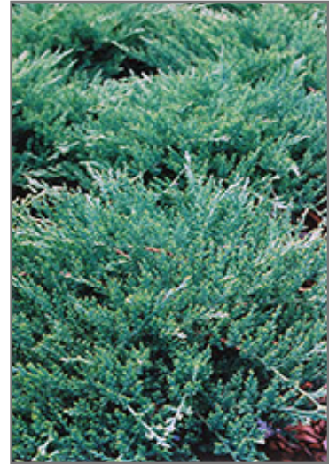
Sargent's Juniper foliage

Sargent's Juniper will grow to be about 24 inches tall at maturity, with a spread of 8 feet. It tends to fill out right to the ground and therefore doesn't necessarily require facer plants in front. It grows at a slow rate, and under ideal conditions can be expected to live for approximately 30 years.