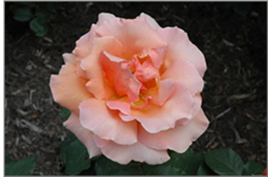
Just Joey Rose flowers