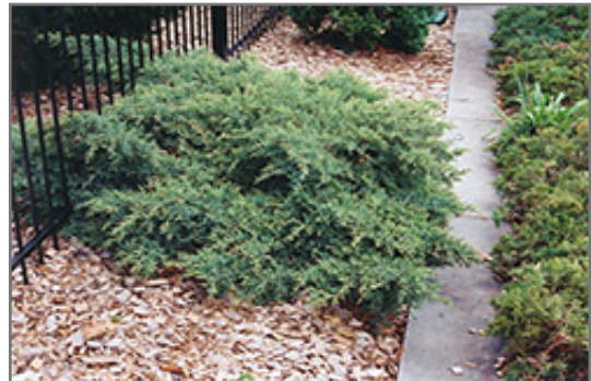
Nick's Compact Juniper Photo courtesy of NetPS Plant Finder

Nick's Compact Juniper will grow to be about 24 inches tall at maturity, with a spread of 5 feet. It tends to fill out right to the ground and therefore doesn't necessarily require facer plants in front. It grows at a slow rate, and under ideal conditions can be expected to live for approximately 30 years.