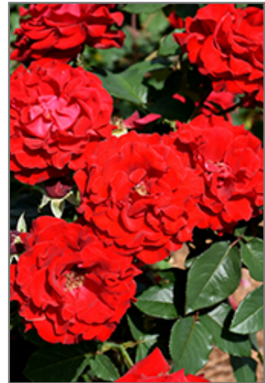
Oh My! Rose flowers