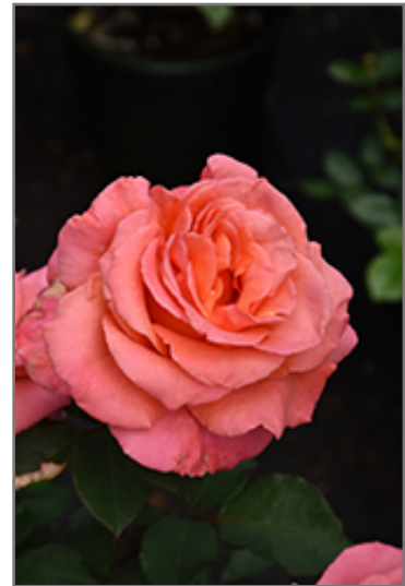
Sedona Rose flowers