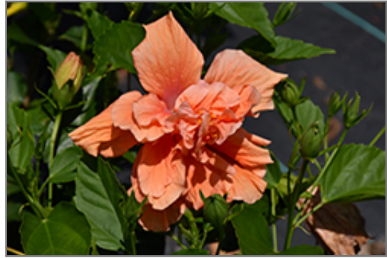
Double Peach Hibiscus flowers

This tropical plant does best in full sun to partial shade. It requires an evenly moist well-drained soil for optimal growth, but will die in standing water. It may require supplemental watering during periods of drought or extended heat. It is not particular as to soil type or pH. It is highly tolerant of urban pollution and will even thrive in inner city environments. Consider applying a thick mulch around the root zone in winter to protect it in exposed locations or colder microclimates. This is a selected variety of a species not originally from North America. It can be propagated by cuttings; however, as a cultivated variety, be aware that it may be subject to certain restrictions or prohibitions on propagation.