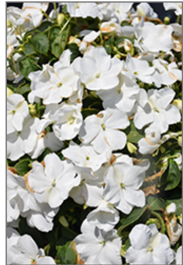
Xtreme White Impatiens flowers