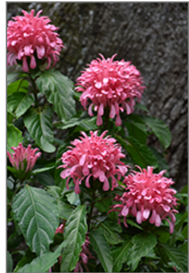
Brazilian Plume Flower flowers