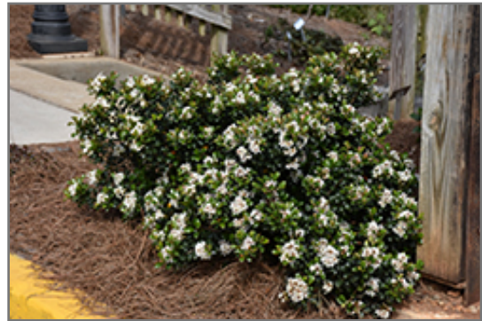
Southern Moon Yedda Hawthorn in bloom

Southern Moon Yedda Hawthorn is recommended for the following landscape applications;