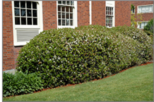
Southern Moon Yedda Hawthorn

This shrub does best in full sun to partial shade. It prefers to grow in average to moist conditions, and shouldn't be allowed to dry out. It may require supplemental watering during periods of drought or extended heat. It is not particular as to soil type or pH. It is somewhat tolerant of urban pollution. This is a selected variety of a species not originally from North America.