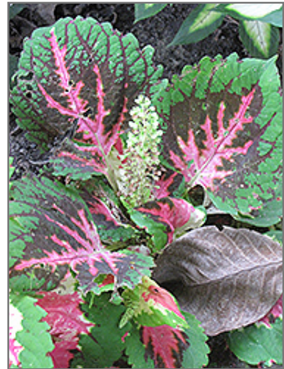
King Kong Coleus foliage