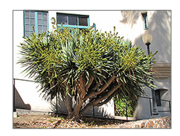
Dragon Tree (shrub form)

This is a relatively low maintenance shrub. When pruning is necessary, it is recommended to only trim back the new growth of the current season, other than to remove any dieback. It has no significant negative characteristics.