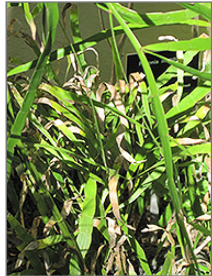
Ribbon Bush

Ribbon Bush will grow to be about 8 feet tall at maturity, with a spread of 8 feet. It tends to fill out right to the ground and therefore doesn't necessarily require facer plants in front, and is suitable for planting under power lines. It grows at a medium rate, and under ideal conditions can be expected to live for approximately 20 years.