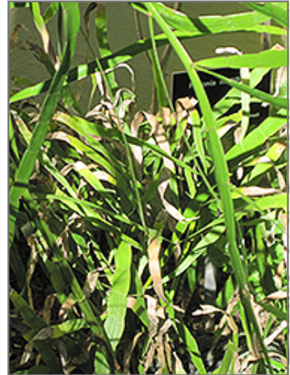
Ribbon Bush

Ribbon Bush will grow to be about 8 feet tall at maturity, with a spread of 8 feet. It tends to fill out right to the ground and therefore doesn't necessarily require facer plants in front, and is suitable for planting under power lines. It grows at a medium rate, and under ideal conditions can be expected to live for approximately 20 years.