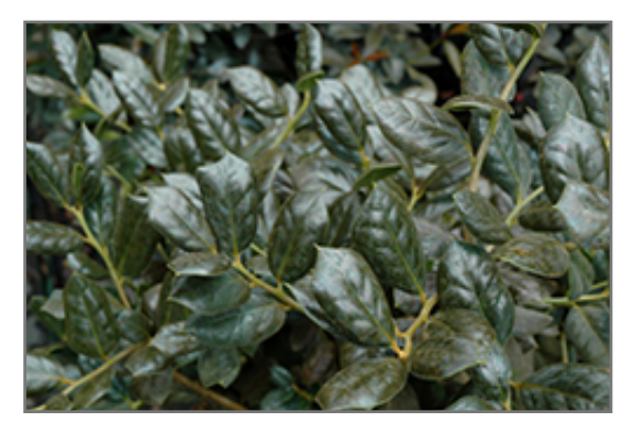
Burford Chinese Holly foliage

Burford Chinese Holly is primarily grown for its highly ornamental fruit. It features an abundance of magnificent red berries in late fall. It has attractive dark green evergreen foliage which emerges light green in spring. The glossy pointy leaves are highly ornamental and remain dark green throughout the winter.