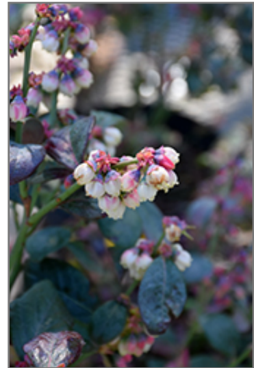
Pink Icing Blueberry flowers

Pink Icing Blueberry will grow to be about 4 feet tall at maturity, with a spread of 4 feet. It has a low canopy. It grows at a fast rate, and under ideal conditions can be expected to live for approximately 20 years. While it is considered to be somewhat self-pollinating, it tends to set heavier quantities of fruit with a different variety of the same species growing nearby.