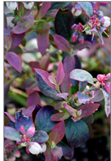
Pink Icing Blueberry foliage