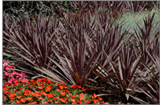
Red Sensation Grass Palm

Red Sensation Grass Palm will grow to be about 15 feet tall at maturity, with a spread of 5 feet. It has a low canopy with a typical clearance of 3 feet from the ground, and is suitable for planting under power lines. It grows at a medium rate, and under ideal conditions can be expected to live for 40 years or more.