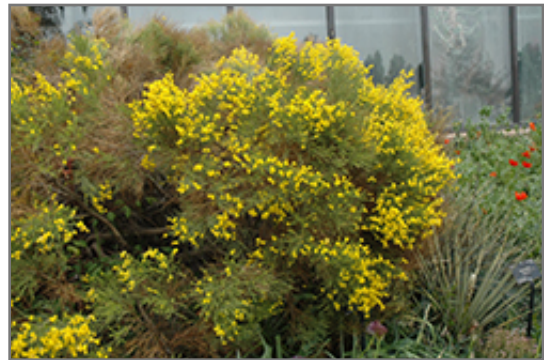
Spanish Broom in bloom