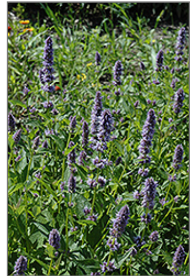
Anise Hyssop flowers