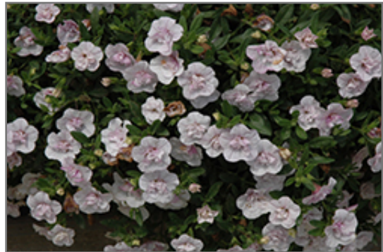
MiniFamous Double Compact Chiffon Calibrachoa flowers

MiniFamous Double Compact Chiffon Calibrachoa is recommended for the following landscape applications;