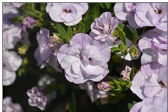
MiniFamous Double Compact Chiffon Calibrachoa flowers