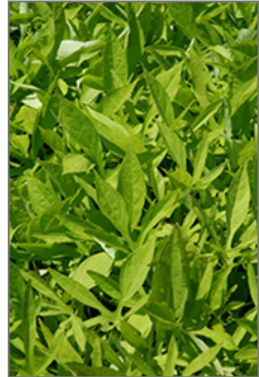
SolarPower Lime Sweet Potato Vine foliage