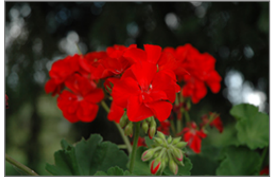
Sunrise Bright Scarlet Geranium flowers