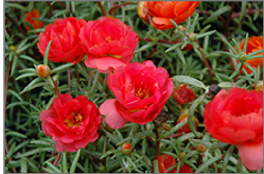
Sundial Red Portulaca flowers

Sundial Red Portulaca will grow to be only 6 inches tall at maturity, with a spread of 12 inches. When grown in masses or used as a bedding plant, individual plants should be spaced approximately 9 inches apart. Its foliage tends to remain low and dense right to the ground. This fast-growing annual will normally live for one full growing season, needing replacement the following year.