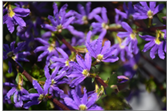
Paper Doll Top Model Fan Flower flowers