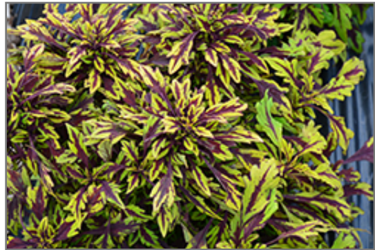
FlameThrower Chipotle Coleus foliage