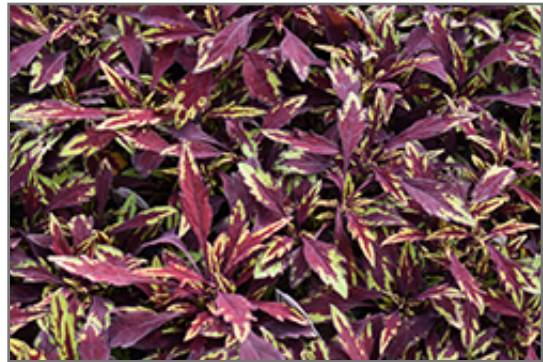
FlameThrower Chipotle Coleus foliage