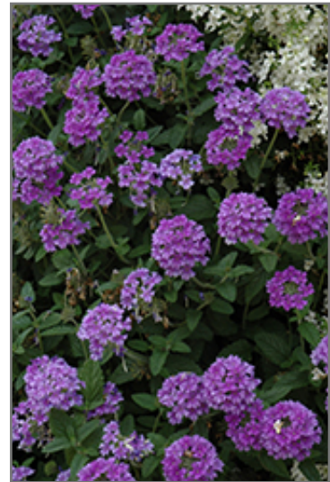
EnduraScape Blue Verbena flowers