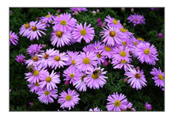
Woods Pink Aster flowers

Bandera Location 8516 Bandera Road San Antonio, TX 78250 (210) 680-2394