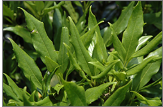
Japanese Aucuba foliage