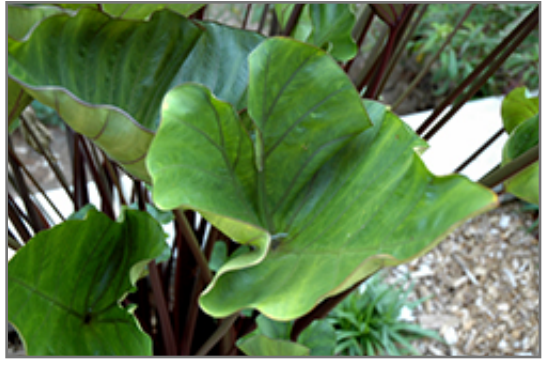
Tea Cup Elephant Ear foliage

This is a relatively low maintenance plant, and should be cut back in late fall in preparation for winter. It has no significant negative characteristics.