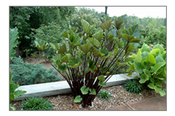
Tea Cup Elephant Ear

Tea Cup Elephant Ear is an open herbaceous perennial with a shapely form and gracefully arching foliage. Its wonderfully bold, coarse texture can be very effective in a balanced garden composition.