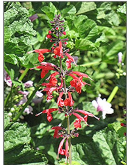
Pineapple Sage flowers

Pineapple Sage is recommended for the following landscape applications;