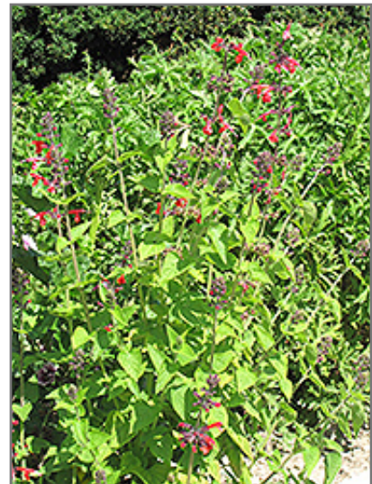
Pineapple Sage in bloom