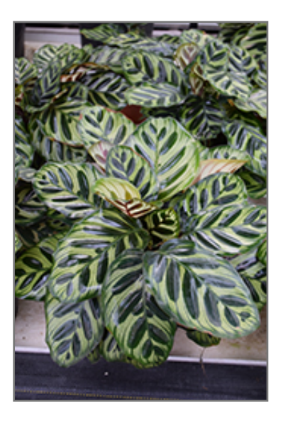
Peacock Plant in full

When grown indoors, Peacock Plant can be expected to grow to be about 24 inches tall at maturity, with a spread of 18 inches. It grows at a slow rate, and under ideal conditions can be expected to live for approximately 5 years. This houseplant should only be grown away from direct sunlight or in a room with strong artificial light. It does best in average to evenly moist soil, but will not tolerate standing water. The surface of the soil shouldn't be allowed to dry out completely, and so you should expect to water this plant once and possibly even twice each week. Be aware that your particular watering schedule may vary depending on its location in the room, the pot size, plant size and other conditions; if in doubt, ask one of our experts in the store for advice. It is not particular as to soil pH, but grows best in rich soil. Contact the store for specific recommendations on pre-mixed potting soil for this plant.