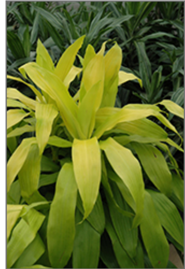
Limelight Dracaena foliage

There are many factors that will affect the ultimate height, spread and overall performance of a plant when grown indoors; among them, the size of the pot it's growing in, the amount of light it receives, watering frequency, the pruning regimen and repotting schedule. Use the information described here as a guideline only; individual performance can and will vary. Please contact the store to speak with one of our experts if you are interested in further details concerning recommendations on pot size, watering, pruning, repotting, etc.