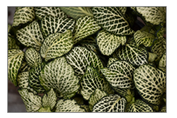
Mosaic Plant foliage

Mosaic Plant's attractive oval leaves remain dark green in color with distinctive white veins and tinges of pink throughout the year on a plant with a spreading habit of growth. It features dainty spikes of white flowers with light green bracts rising above the foliage from mid to early winter.