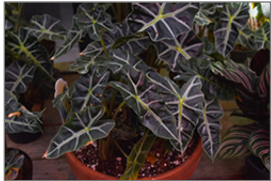
Amazon Elephant's Ear foliage

When grown indoors, Amazon Elephant's Ear can be expected to grow to be about 3 feet tall at maturity, with a spread of 3 feet. It grows at a medium rate, and under ideal conditions can be expected to live for approximately 5 years. This houseplant performs well in both bright or indirect sunlight and strong artificial light, and can therefore be situated in almost any well-lit room or location. It prefers to grow in average to moist soil. The surface of the soil shouldn't be allowed to dry out completely, and so you should expect to water this plant once and possibly even twice each week. Be aware that your particular watering schedule may vary depending on its location in the room, the pot size, plant size and other conditions; if in doubt, ask one of our experts in the store for advice. It is not particular as to soil type or pH; an average potting soil should work just fine. Be warned that parts of this plant are known to be toxic to humans and animals, so special care should be exercised if growing it around children and pets.