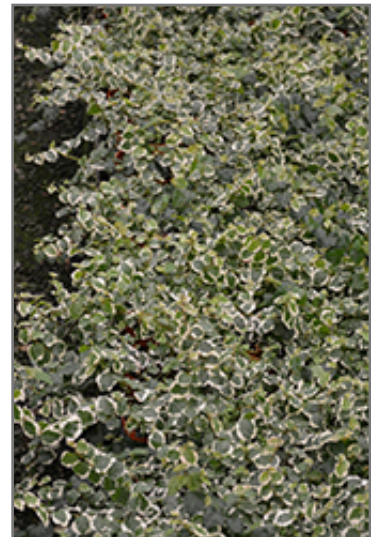
Variegated Creeping Fig in full