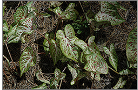
Gingerland Caladium foliage

When grown indoors, Gingerland Caladium can be expected to grow to be about 15 inches tall at maturity, with a spread of 18 inches. It grows at a medium rate, and under ideal conditions can be expected to live for approximately 10 years. This houseplant performs well in both bright or indirect sunlight and strong artificial light, and can therefore be situated in almost any well-lit room or location. It prefers to grow in average to moist soil. The surface of the soil shouldn't be allowed to dry out completely, and so you should expect to water this plant once and possibly even twice each week. Be aware that your particular watering schedule may vary depending on its location in the room, the pot size, plant size and other conditions; if in doubt, ask one of our experts in the store for advice. It is not particular as to soil type or pH; an average potting soil should work just fine.