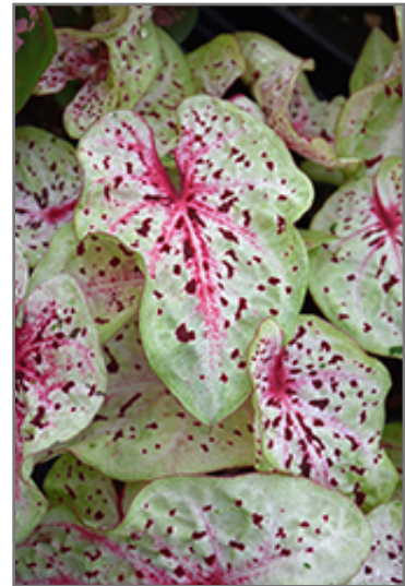
Miss Muffet Caladium foliage

This stunning variety offers speckles, splashes, and spectacular contrast; chartreuse leaves with white veins, spattered with burgundy spots and blush; a great container or basket plant, indoors or out