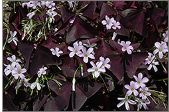
Purple Shamrock flowers

When grown indoors, Purple Shamrock can be expected to grow to be only 6 inches tall at maturity extending to 8 inches tall with the flowers, with a spread of 6 inches. It grows at a medium rate, and under ideal conditions can be expected to live for approximately 10 years. This houseplant will do well in a location that gets either direct or indirect sunlight, although it will usually require a more brightly-lit environment than what artificial indoor lighting alone can provide. It is very adaptable to both dry and moist soil, but will not tolerate any standing water. The surface of the soil shouldn't be allowed to dry out completely, and so you should expect to water this plant once and possibly even twice each week. Be aware that your particular watering schedule may vary depending on its location in the room, the pot size, plant size and other conditions; if in doubt, ask one of our experts in the store for advice. It is not particular as to soil type or pH; an average potting soil should work just fine.