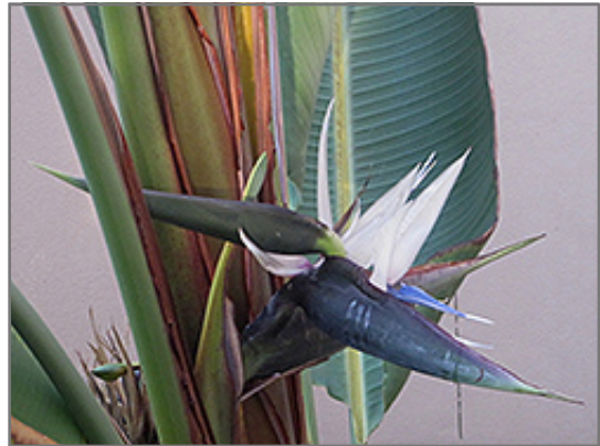
White Bird Of Paradise flowers

This is a multi-stemmed evergreen houseplant with an upright spreading habit of growth. Its wonderfully bold, coarse texture is quite ornamental and should be used to full effect. You may trim off the flower heads after they fade and die to encourage repeat blooming.