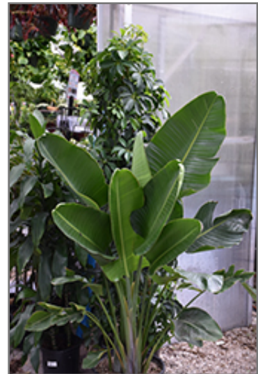
White Bird Of Paradise

Bandera Location 8516 Bandera Road San Antonio, TX 78250 (210) 680-2394