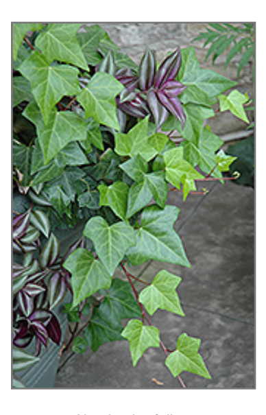
Algerian Ivy foliage

When grown indoors, Algerian Ivy can be expected to grow to be about 10 feet tall at maturity, with a spread of 3 feet. It grows at a fast rate, and under ideal conditions can be expected to live for approximately 30 years. This houseplant performs well in both bright or indirect sunlight and strong artificial light, and can therefore be situated in almost any well-lit room or location. It is very adaptable to both dry and moist soil, and should do just fine under average home conditions. The surface of the soil shouldn't be allowed to dry out completely, and so you should expect to water this plant once and possibly even twice each week. Be aware that your particular watering schedule may vary depending on its location in the room, the pot size, plant size and other conditions; if in doubt, ask one of our experts in the store for advice. It is not particular as to soil pH, but grows best in rich soil. Contact the store for specific recommendations on pre-mixed potting soil for this plant. Be warned that parts of this plant are known to be toxic to humans and animals, so special care should be exercised if growing it around children and pets.