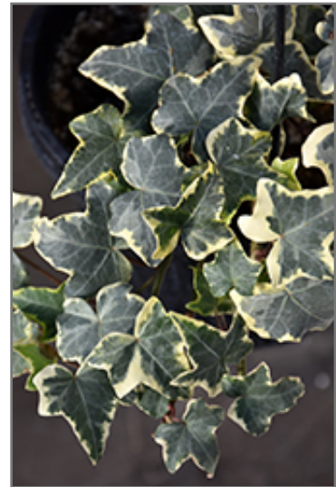
Glacier Ivy foliage

When grown indoors, Glacier Ivy can be expected to grow to be about 10 feet tall at maturity, with a spread of 3 feet. It grows at a medium rate, and under ideal conditions can be expected to live for approximately 30 years. This houseplant performs well in both bright or indirect sunlight and strong artificial light, and can therefore be situated in almost any well-lit room or location. It prefers to grow in average to moist soil. The surface of the soil shouldn't be allowed to dry out completely, and so you should expect to water this plant once and possibly even twice each week. Be aware that your particular watering schedule may vary depending on its location in the room, the pot size, plant size and other conditions; if in doubt, ask one of our experts in the store for advice. It is not particular as to soil pH, but grows best in rich soil. Contact the store for specific recommendations on pre-mixed potting soil for this plant. Be warned that parts of this plant are known to be toxic to humans and animals, so special care should be exercised if growing it around children and pets.