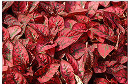
Splash Select Red Polka Dot Plant foliage

When grown indoors, Splash Select Red Polka Dot Plant can be expected to grow to be about 12 inches tall at maturity, with a spread of 12 inches. It grows at a fast rate, and under ideal conditions can be expected to live for approximately 5 years. This houseplant will do well in a location that gets either direct or indirect sunlight, although it will usually require a more brightly-lit environment than what artificial indoor lighting alone can provide. It does best in average to evenly moist soil, but will not tolerate standing water. The surface of the soil shouldn't be allowed to dry out completely, and so you should expect to water this plant once and possibly even twice each week. Be aware that your particular watering schedule may vary depending on its location in the room, the pot size, plant size and other conditions; if in doubt, ask one of our experts in the store for advice. It is not particular as to soil type or pH; an average potting soil should work just fine.