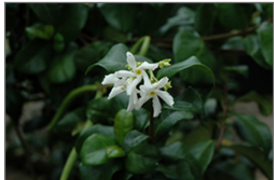
Madison Star-Jasmine flowers