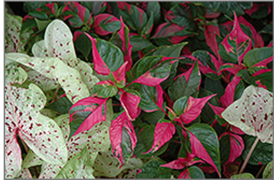
Party Time Alternanthera foliage

There are many factors that will affect the ultimate height, spread and overall performance of a plant when grown indoors; among them, the size of the pot it's growing in, the amount of light it receives, watering frequency, the pruning regimen and repotting schedule. Use the information described here as a guideline only; individual performance can and will vary. Please contact the store to speak with one of our experts if you are interested in further details concerning recommendations on pot size, watering, pruning, repotting, etc.