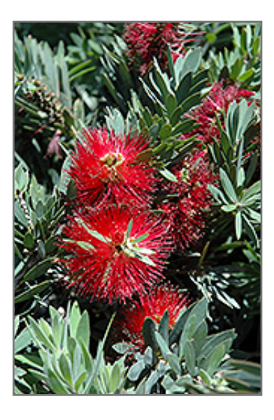
Little John Dwarf Bottlebrush flowers

When grown indoors, Little John Dwarf Bottlebrush can be expected to grow to be about 3 feet tall at maturity, with a spread of 4 feet. It grows at a medium rate, and under ideal conditions can be expected to live for approximately 30 years. This houseplant will do well in a location that gets either direct or indirect sunlight, although it will usually require a more brightly-lit environment than what artificial indoor lighting alone can provide. It prefers to grow in average to moist soil. The surface of the soil shouldn't be allowed to dry out completely, and so you should expect to water this plant once and possibly even twice each week. Be aware that your particular watering schedule may vary depending on its location in the room, the pot size, plant size and other conditions; if in doubt, ask one of our experts in the store for advice. It is not particular as to soil type or pH; an average potting soil should work just fine.