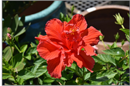
Double Red Hibiscus flowers

There are many factors that will affect the ultimate height, spread and overall performance of a plant when grown indoors; among them, the size of the pot it's growing in, the amount of light it receives, watering frequency, the pruning regimen and repotting schedule. Use the information described here as a guideline only; individual performance can and will vary. Please contact the store to speak with one of our experts if you are interested in further details concerning recommendations on pot size, watering, pruning, repotting, etc.